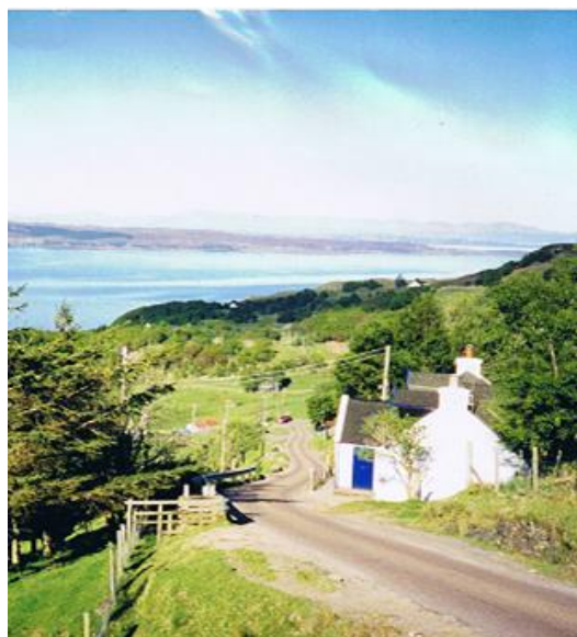
Grace Cottage and Loch Diabaigus Arde in winter