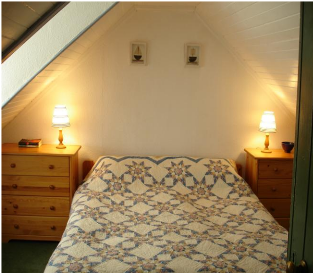
Double bedroom above and snug to the right