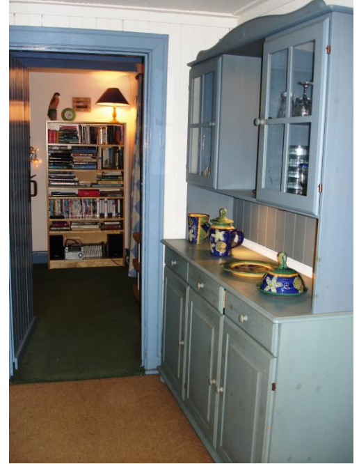
Looking through to snug from kitchen