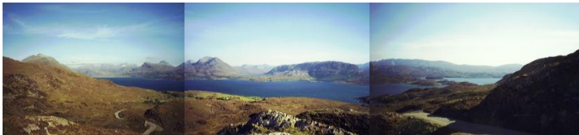
Bealach na Gaoithe - The road to Diabaig

There is really nothing we can say that will do justice to the lochs and mountains around Diabaig. The changing light is an artist and photographer's dream. The stars fill the heavens and the dawns and sunsets are rarely less than dramatic. Walking, you may see Pine martens and Eagles, as well as Deer, Otter and Mountain goats. The coast path goes for miles and miles, allowing you to see Skye and the Outer Hebrides in all their glory. Whatever the weather, one is always drawn into the solitude found in this unique landscape.